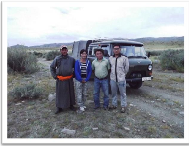
The survey team