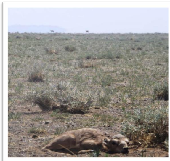
Saigas and their young in their calving ground