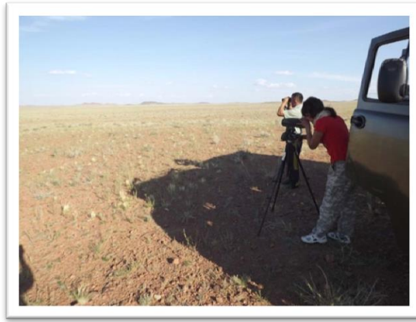
Finding shade out in the field was a challenge