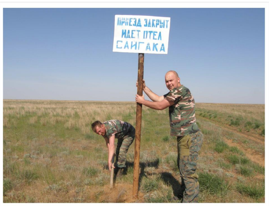
Rangers putting up the 'Saiga maternity Ward' signs