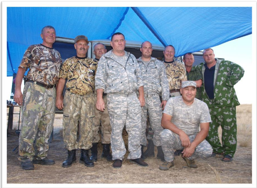
One of the Stepnoi's ranger teams