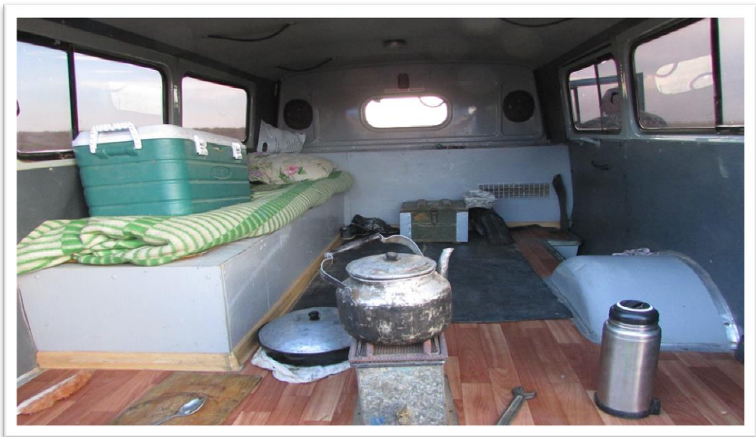
Bijoux living quarters