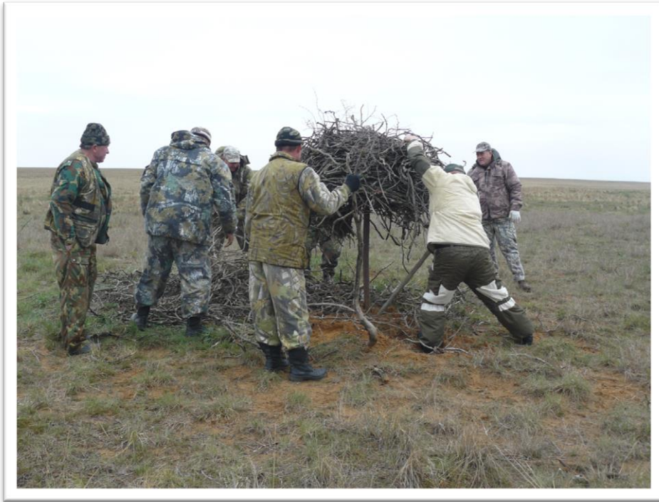
Rangers making an artificial birds nest