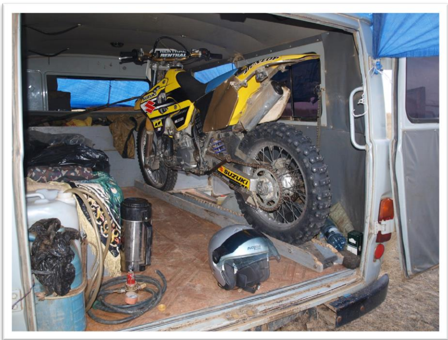
The mini-vans double up as living quarters as well as a place to keep the all-terrain bikes used to chase poachers